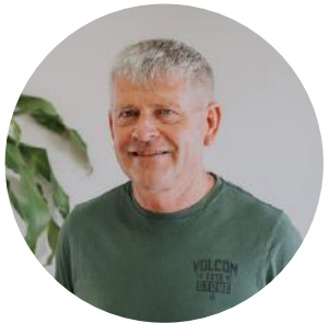
Craig Neale Wholegrain Milling